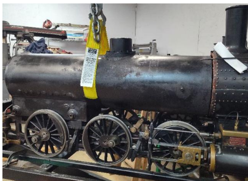
Rebuilt Boiler being test fitted on the chassis.