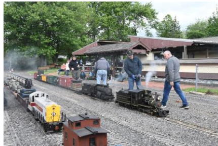
The Yard was full most of the time and the Water Tap was busy.