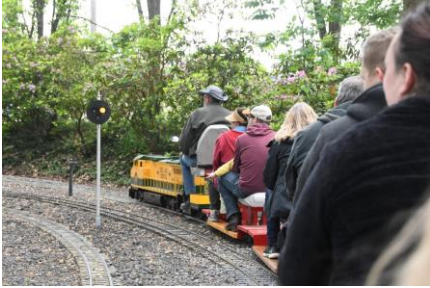
The Club train was full most of time.