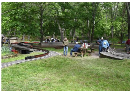
The Main Gauge 1 Layout was also very active all weekend.