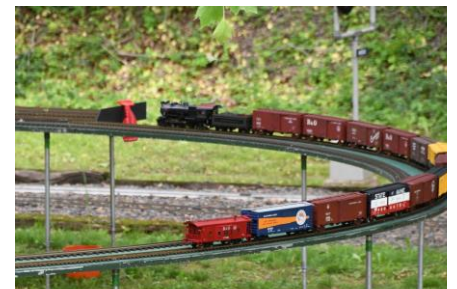
Mike Moore's portable Layout was very active all weekend.