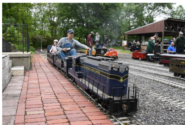
CN Diesel 2309 in the Yard with B&O 752 in the foreground note the happy passenger.