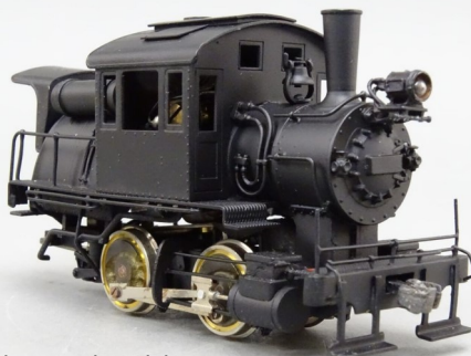
Not actual model