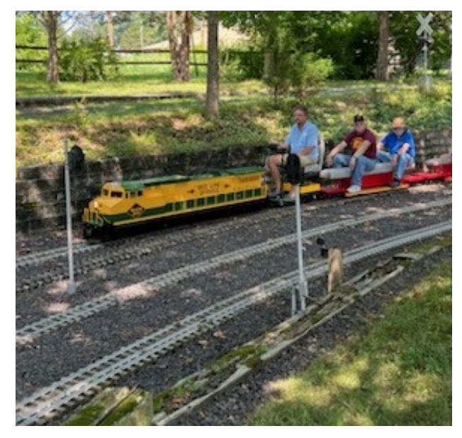
The Company Train rolls into the yard.