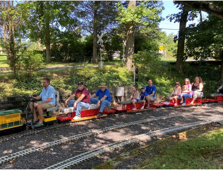
Beautiful day for a scenic ride through the woods.