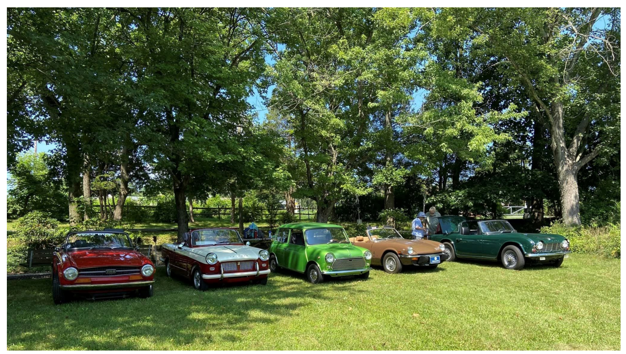
PLS played host to the DelVal Triumph Club. These are some of the sports cars they arrived in.