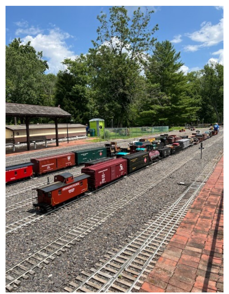
The yard beginning to fill with freight cars for the day's runs.