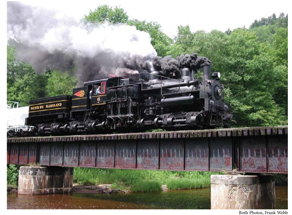
Top: Western Maryland #6 at the Cass Railway, West Virginia. Below: The steam siphon on the WM #6

What I find very interesting is one of the ways we go about reproducing the details in the engines and equipment we model and the lengths we go to find and reproduce those details. Where builder's drawings are limited or no longer available the common source is a photograph and as everyone knows "a picture's worth a thousand words" or the number of rivets in a side-frame, smoke box, cab or tender. Some of us have been known to travel thousands of miles just to see the last remaining example of a piece of equipment so we can take many pictures to capture otherwise elusive details. Many of you may know that our mem-