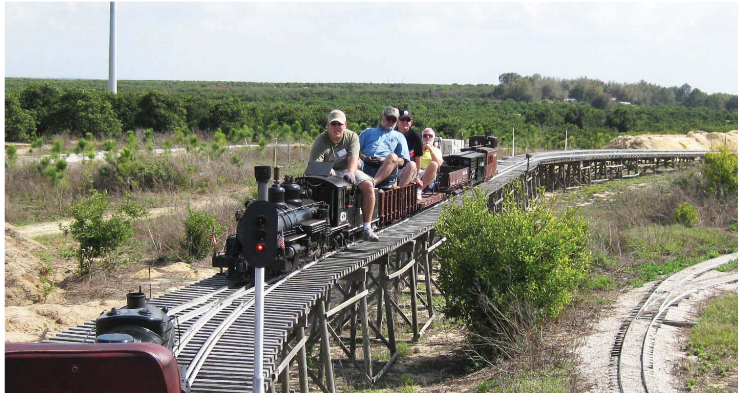
Bidirectional running on the Ridge Live Steam Railroad. Note new railroad construction on the left top.