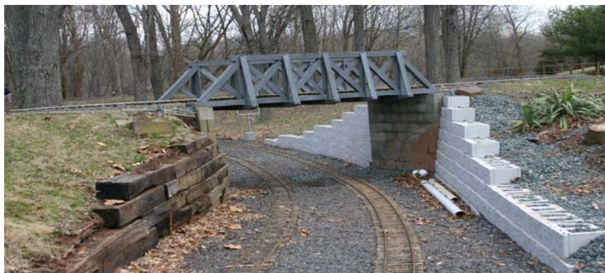
March- 2008- New Retaining Wall