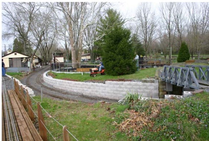
April 2008- New Retaining Wall